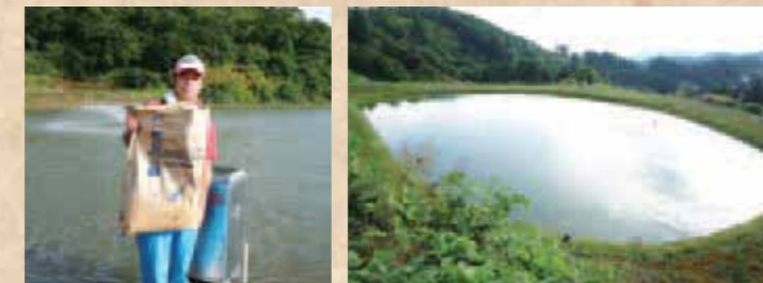
We use large-scale, natural field ponds in the mountains of Ojiya with help from the farm members residing there. This combination of natural environment and superior care help us grow the first-class koi we are known for.

Technically speaking, we've found frequent feeding with careful observation is also an important practice that brings